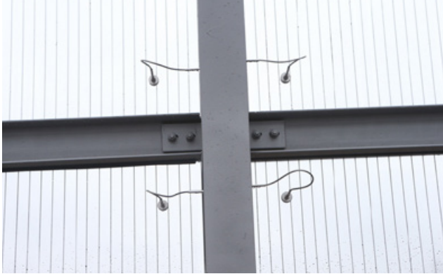
Reinforced transparent sheets