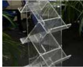
POS display stands