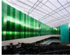
Curtain walls and Interior decoration