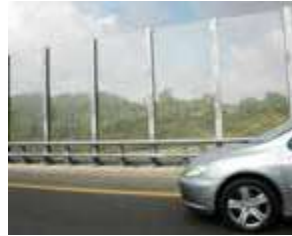
Noise reduction barriers