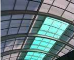
Sky light / Domes