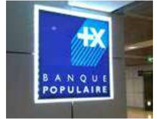
Lighting, Illumination and signage